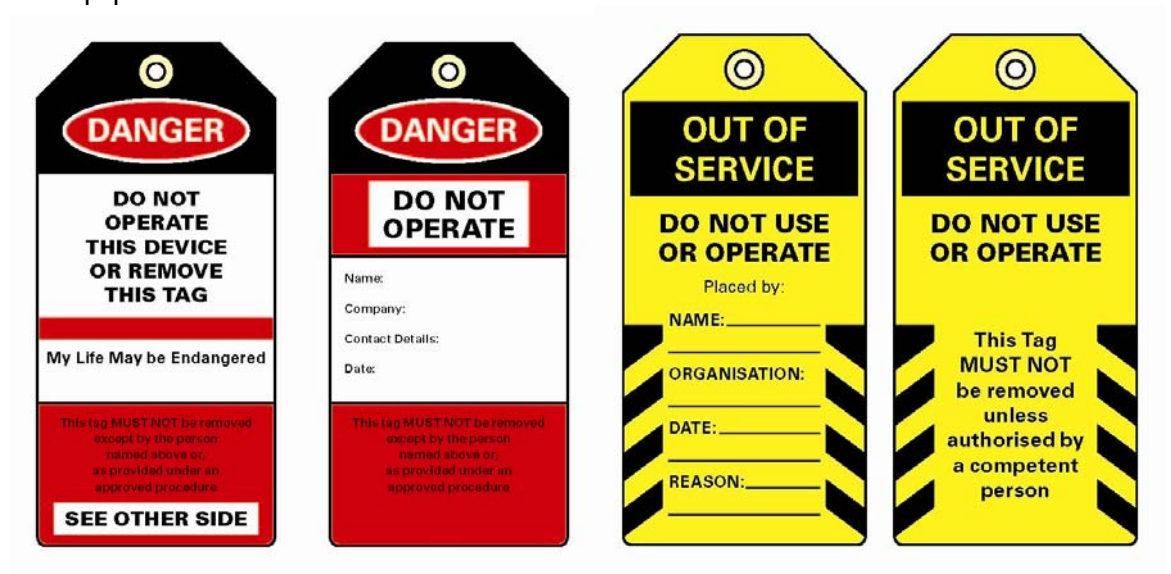
Figure 6: Example of a danger tag and out of service tag