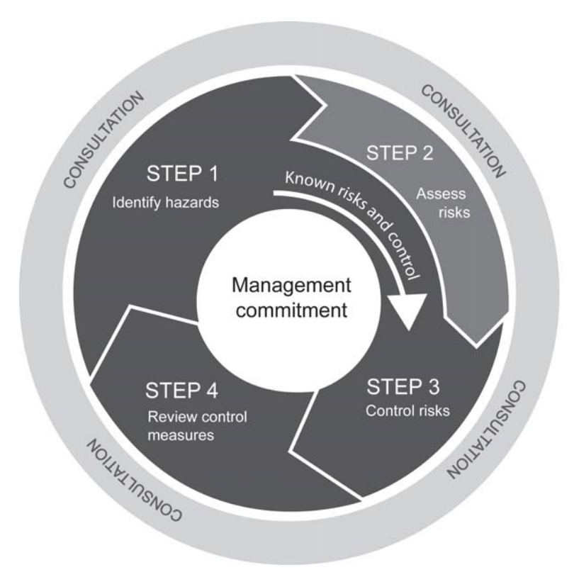
Figure 1: The risk management process

Many hazards and their associated risks are well known and have well established and accepted control measures. In these situations, the second step to formally assess the risk is unnecessary. If, after identifying a hazard, you already know the risk and how to control it effectively, you may simply implement the controls.